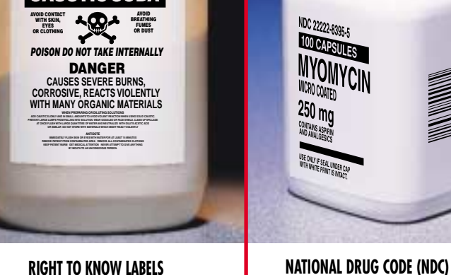
NATIONAL DRUG CODE (NDC) LABELS