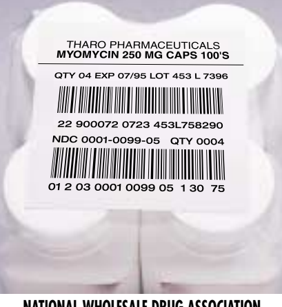
NATIONAL WHOLESALE DRUG ASSOCIATION (NWDA) PHARMACEUTICAL LABELS